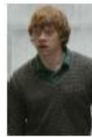
Ronald Weasley ECOSOC