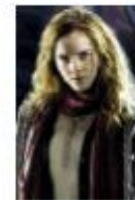
Hermione Granger Security Council