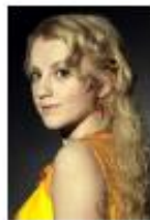
Luna Lovegood Disarmament