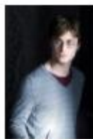
Harry Potter Human Rights