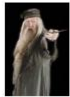
Albus Dumbledore Political I