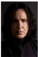
Severus Snape Political II